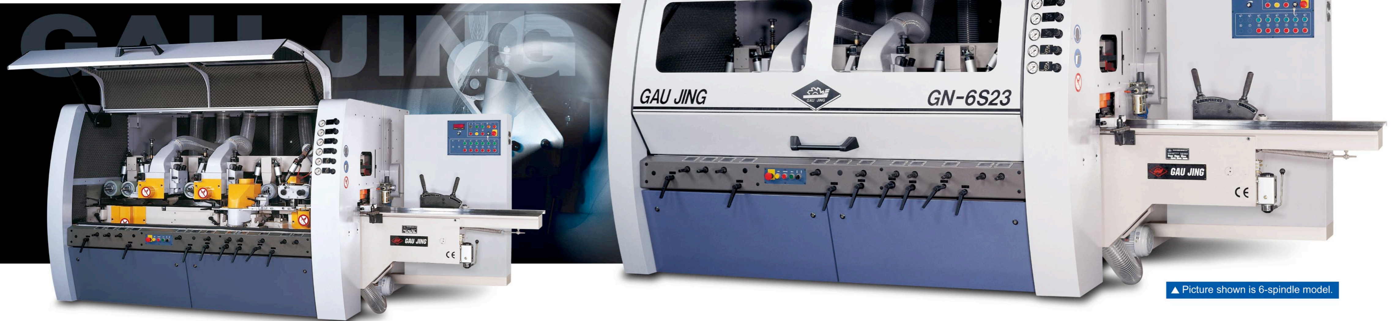
▲ Picture shown is 6-spindle model.

The machines are quality constructed ensuring maximum dependability after years of operation.